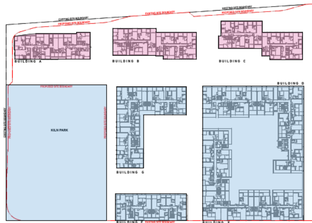
1 Level 02 1:800