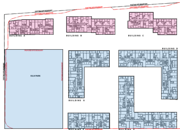
2 Level 03 1:800